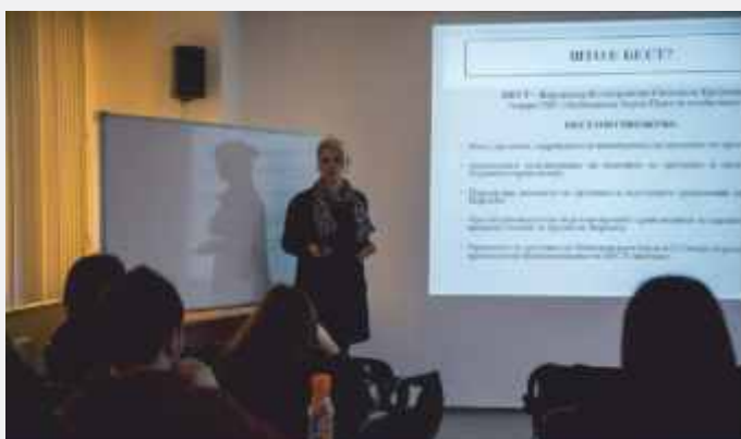
"Macedonian Stock Exchange" simulation, 2014