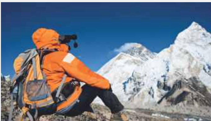
"Climbing Everest" simulation HBS, 2014