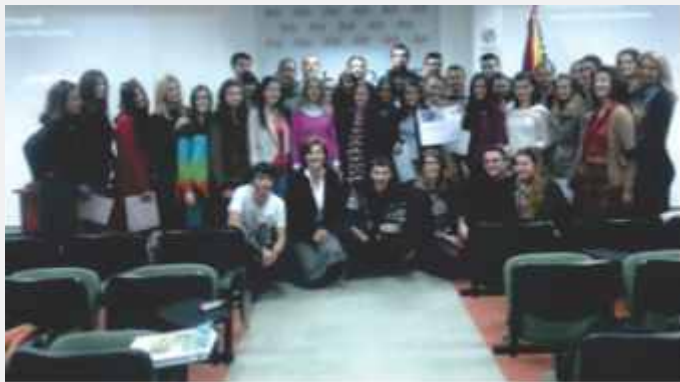
Virtual company with Bologna University, 2014